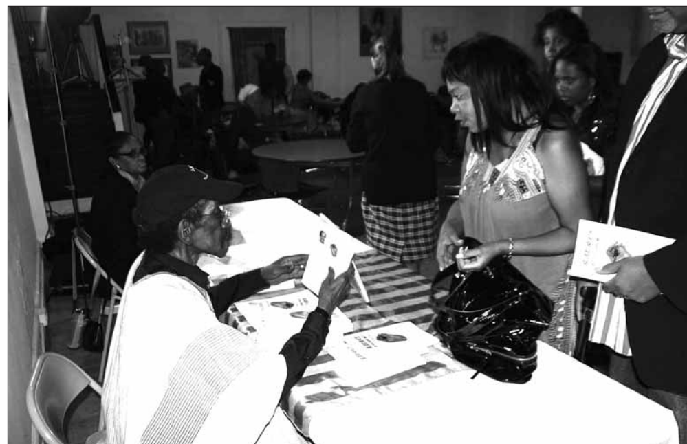
Guests anxiously waiting to purchase an autographed copy of "Blood Beats in Four Square Miles."

Readers interested in purchasing a copy of Fair's historic book can do so at www.amazon.com , or by visiting the AC-BAW Center for the Arts, located at 128 S 4th Avenue in Mt Vernon, NY.