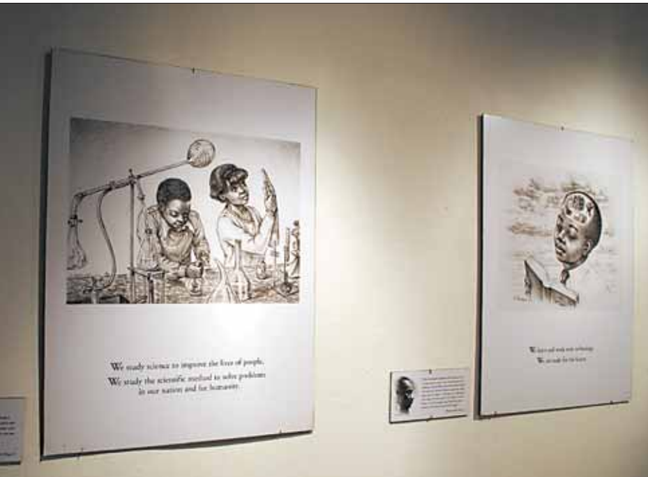
A partial view of an exhibit currently on display at AC-BAW

In 1980, AC-BAW rented an abandoned furniture store on Fourth Avenue. The organization then entered into a joint program with the City of Mount Vernon as well as local banks and the Gannett Foundation, to develop innovative education and arts programs, in their acquired commercial space.