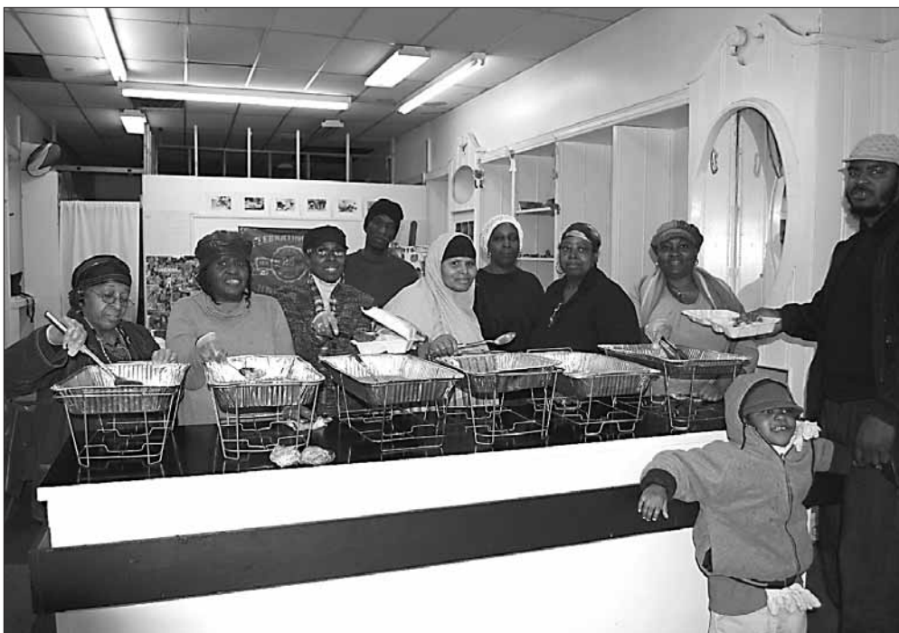
Sisters of Masjid Yusuf pictured behind the food counter at AC-BAW

128 South 4th Avenue Mt. Vernon, NY 10550 (914) 667-7278 www.acbaw.org